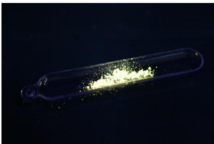
Excitation Color at 366nm

All applications using this product should be thoroughly tested prior to approval for production.